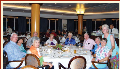
South Pacific Solar Eclipse Travel Group, November 2012.

Got photos of ILEAD classes or events? We need your images! Contact the office for details!