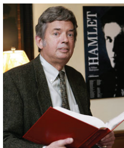
Image reprinted with permission of Dartmouth Life. Photo by Joseph Mehling '69.

What is surprising is that his Continued on Page 2